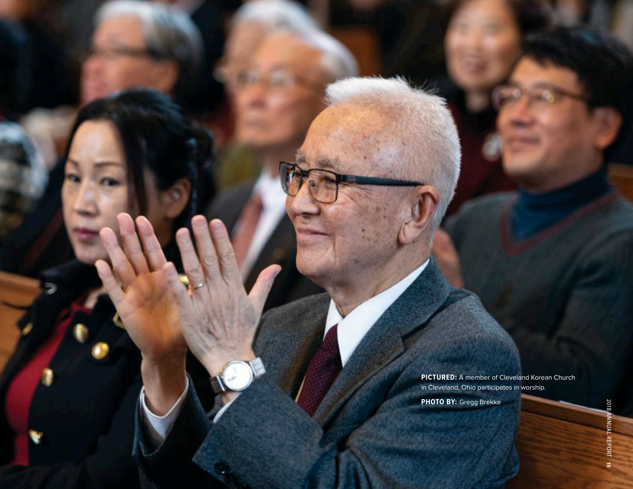
PICTURED: A member of Cleveland Korean Church in Cleveland, Ohio participates in worship.