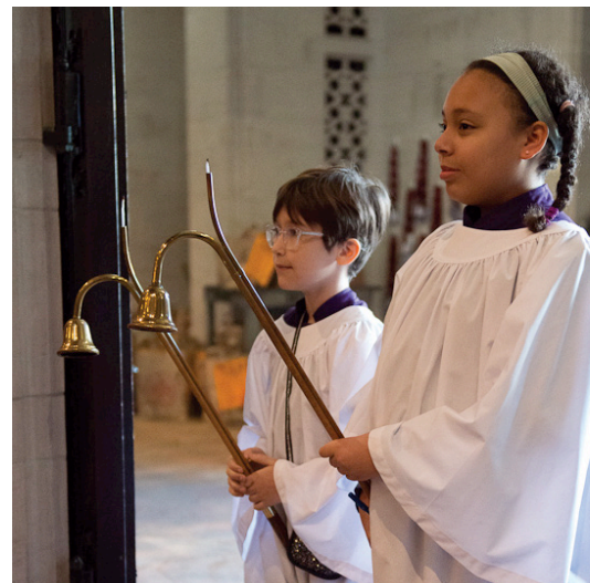
PICTURED: Worship at East Liberty Presbyterian Church in Pittsburgh, Pennsylvania.