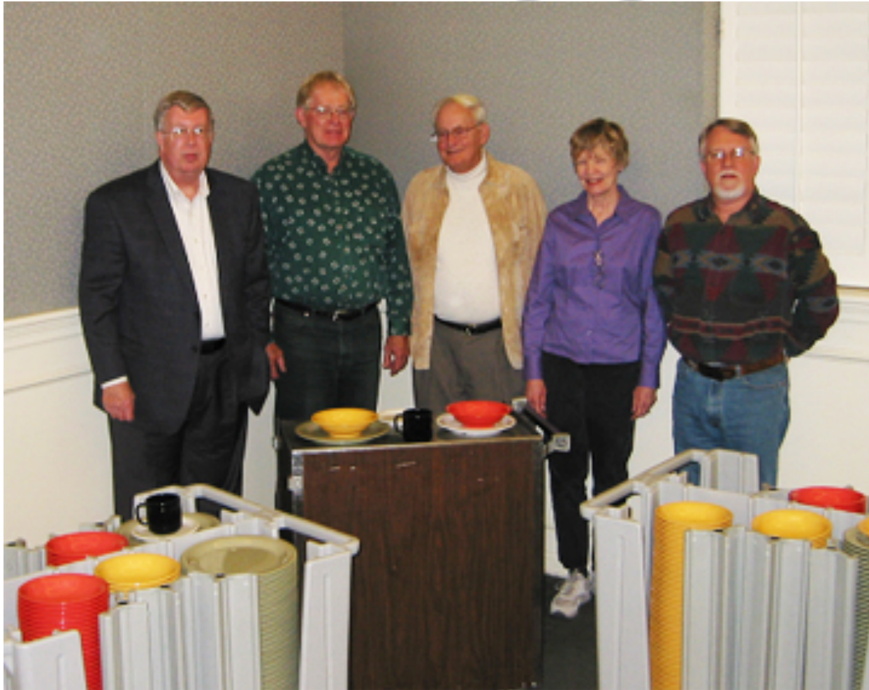
Village Presbyterian Church, Prairie Village, KS (reusable dishes)