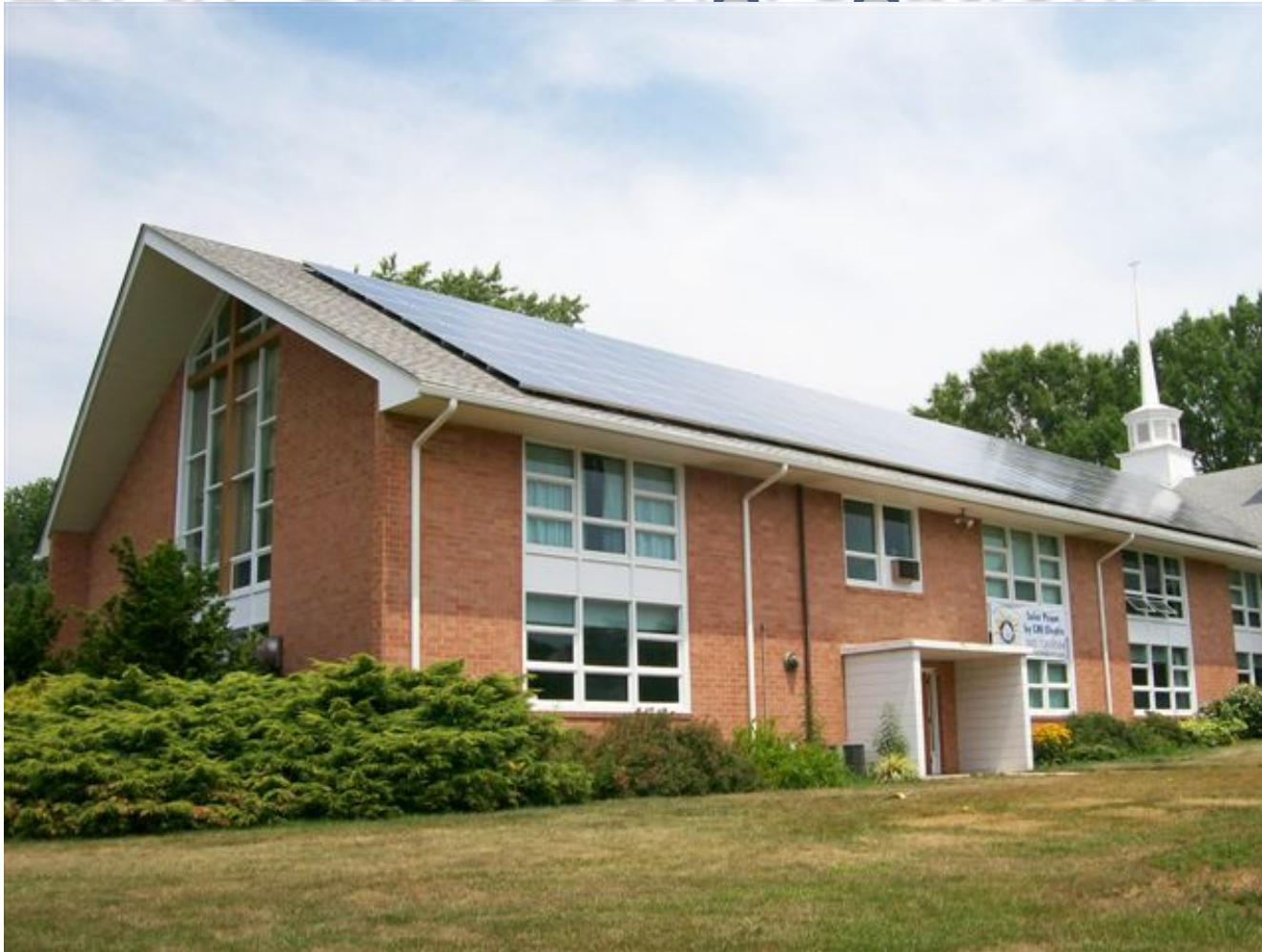
Limestone Presbyterian Church, Wilmington, DE (solar panels)