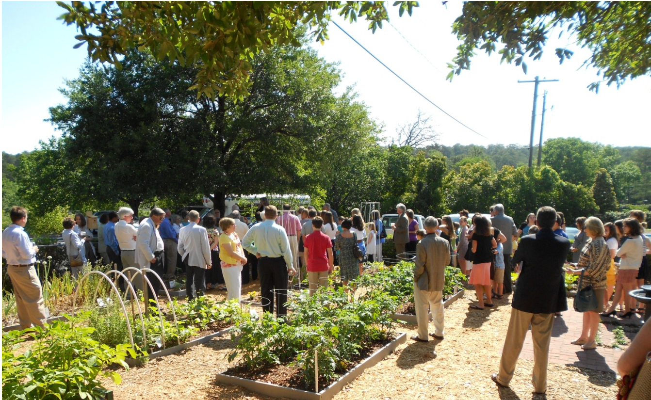
Forest Lake Presbyterian Church, Columbia, SC (intergenerational community garden)