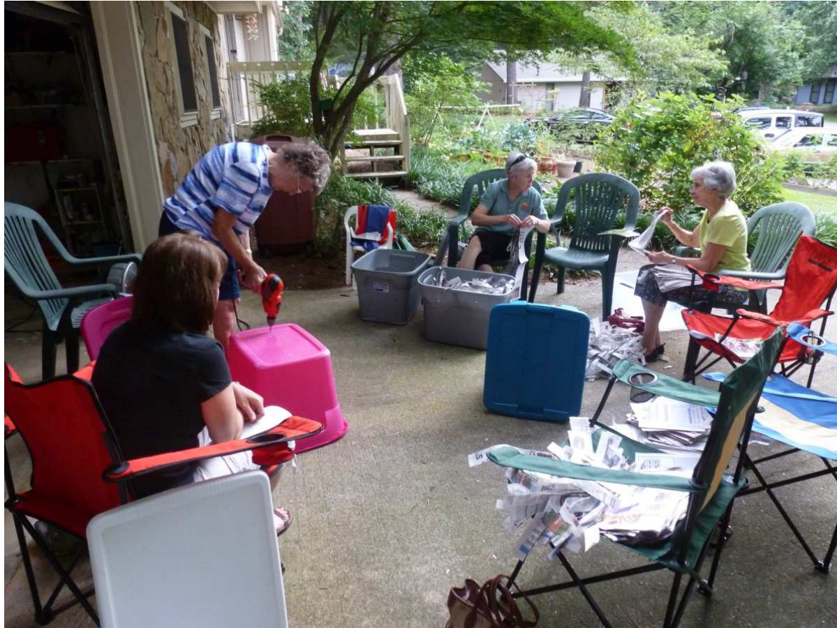
St. Andrews Presbyterian Church, Tucker, GA (creating worm bins for vermiculture)