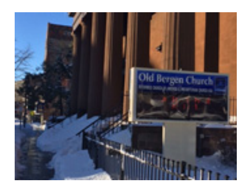
Old Bergen Church making most of New Beginnings. Neighborhood prayer walks help historic congregation experience new life.