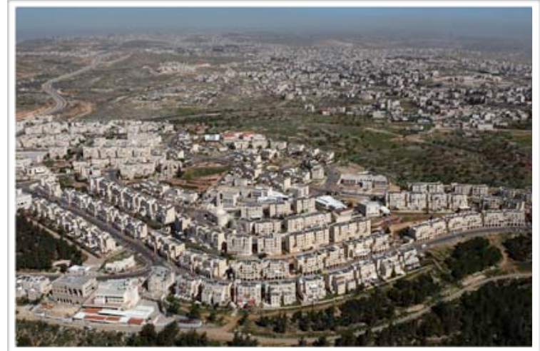
Sprawling Israeli settlement Ramat Shlomo in the West Bank

Palestinian Christian leaders have explicitly called for nonviolence and economic pressure in the courageous confessional document Kairos Palestine , invoking the example of South Africa, where churches played a key role in that transition. The United Methodist Church and the United Church of Canada adopted virtually identical boycott positions as that of PC(USA), also after years of making words-only statements that are easily ignored by Israel, a country that has not yet declared its borders.